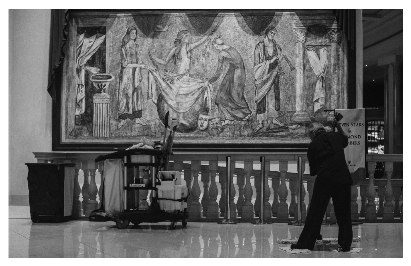
Figure 5: Janitor cleaning in front of a faux-Grecian mosaic of Aphrodite; 2018.

with risk, destruction, and narrow-focused innovation. This cycle of creative destruction and destructive creation—this constant desire for novelty—extends beyond the Strip: Subtracting deserts and imploding terrains are common practice in the advent of new development. Absent of limits, development in Las Vegas, is beginning to encroach on conserved Mojave deserts landscapes such as Red Rock Canyon National Conservation Area and the Spring Mountains National Recreation Area.