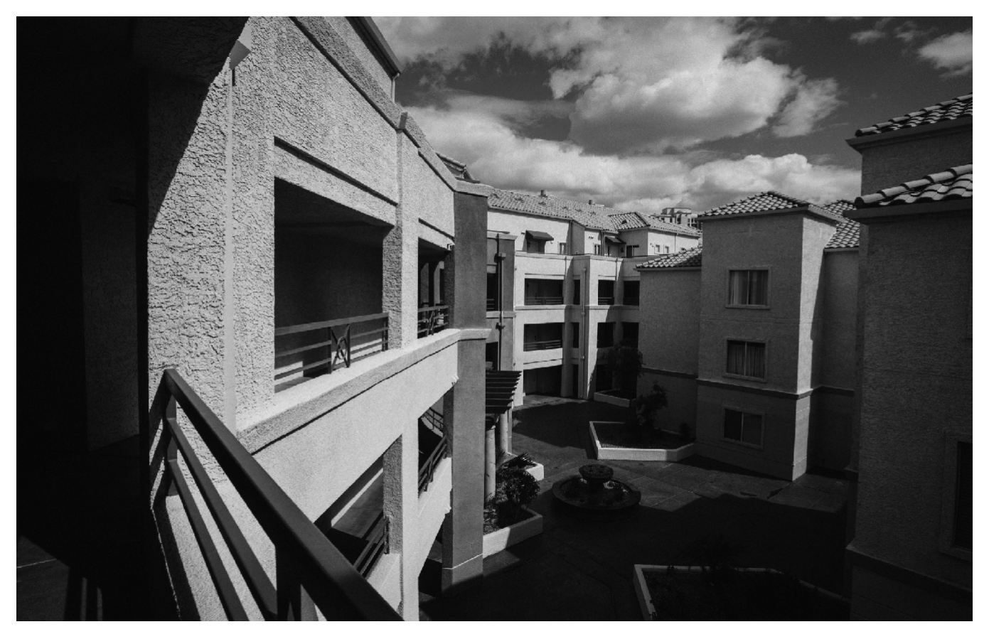
Figure 2: Interior courtyard of a private, and gated, apartment complex; 2018.

In other words, Las Vegas is in a state of denial over its arid milieu. The conservationist attitudes more appropriate for "desert living" stand in direction opposition to the capitalist model of continuous growth. Yet, without constant growth, under current operating procedures, Las Vegas would languish. Paradoxically, its thriving is built on dying-but for how long? And now that the springs that attracted early settlers were pumped to extinction and the meadows which give Las Vegas its name were paved over, new paradigms must emerge and new procedures for the city must be formulated. For example, a problem that might surprise outsiders is that Las Vegas experiences drastic seasonal flooding. And until recently, rainwater collection systems in the entire state of Nevada were prohibited. Even a bucket on a porch was illegal. And while on a state-wide basis the recharging of the aquifers is important, urban Las Vegas—where the majority of the city is covered in impermeable surfaces-demands a more complex solution.