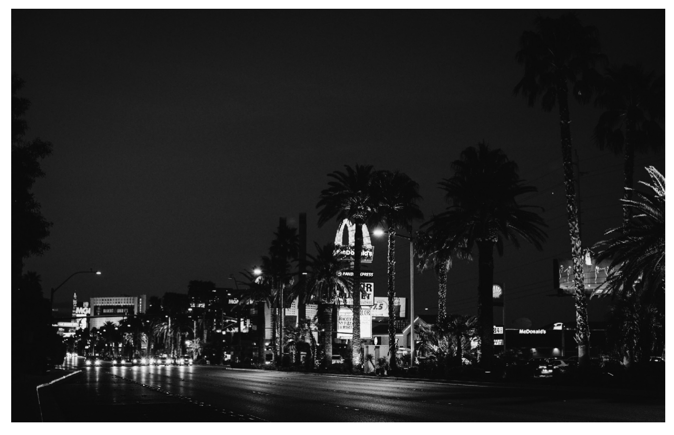
Figure 1: View from South Las Vegas Boulevard toward the Strip; 2018.

dialectics—decoupling what is often seen as just a one-sided fantasia—and end with projective speculations about the liminal gradients that ultimately manifest in the in-between.